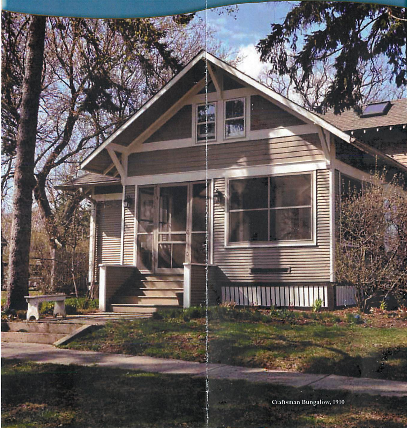
Craftsman Bungalow, 1910