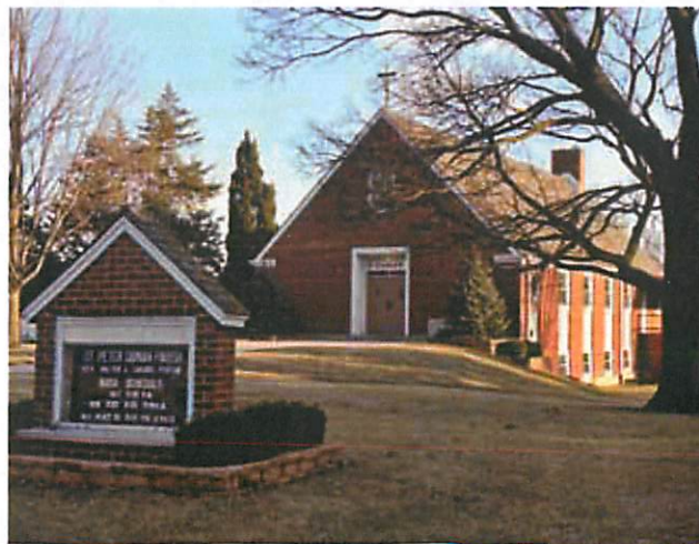
St. Peter Damian Chapel was built in 1950 at 309 E. North Ave and is owned by the Archdiocese of Chicago