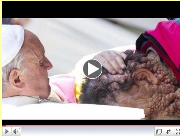
Pics cast Francis as a new kind of pope